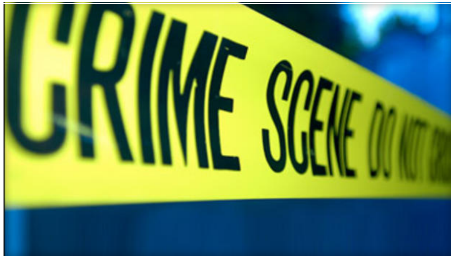
crime scene generic

Share / Tweet / Reddit / Flipboard / Email